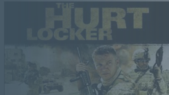
The Hurt Locker