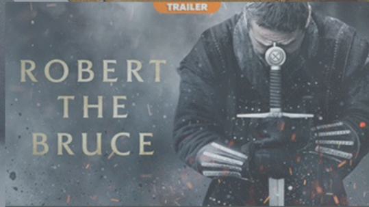
Robert the Bruce